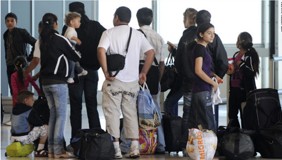
People belonging to the Roma community wait to board a flight at Lyon airport on Thursday.