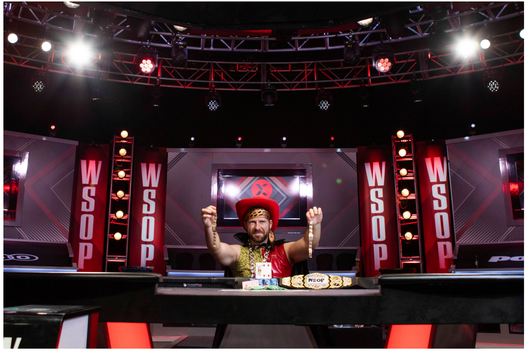
Dan Cates at WSOP 2022

<u>By: Danica Serena Stockton</u> | June 14, 2023 | <u>Magazine People Feature Events</u> <u>Interviews</u>